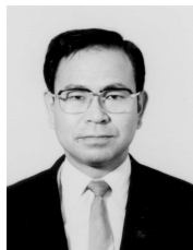
Fusao Wada Zuken Inc.